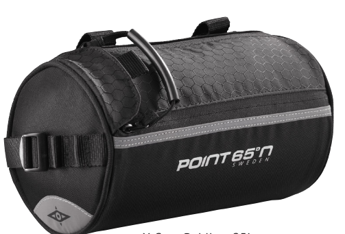
X-Case Boblbee 25L

for cables, batteries and memory cards. Of course you can also use the Camera Insert as an independent camera bag as it comes equipped with a detachable shoulder strap.