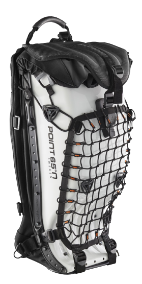
Cargo Net on back pack