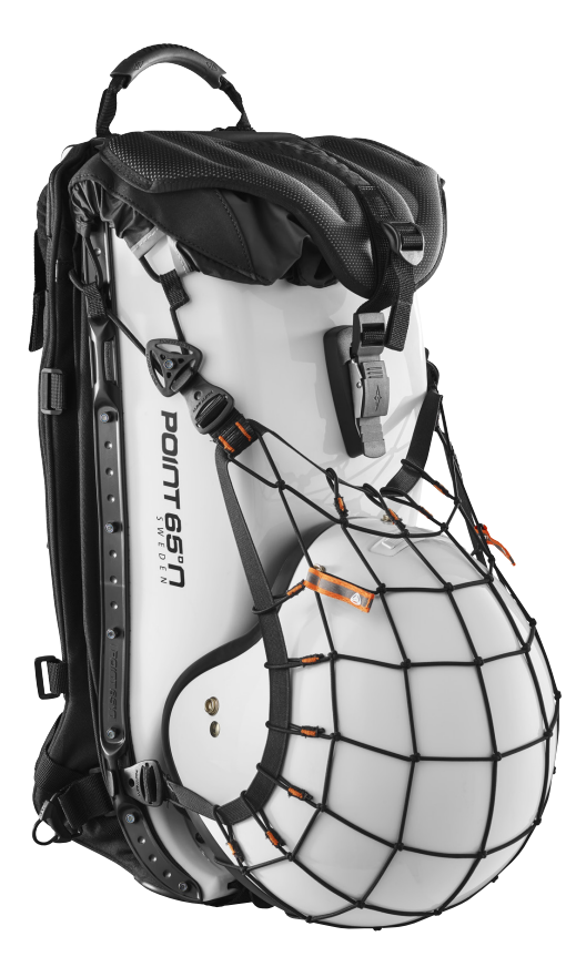
Cargo Net Helmet on back pack

For all those things you need quick and easy access to, like your wind breaker, gloves, etc. Also perfect for your bike helmet or football. Handmade with enduring nylon coated elastics cords. The bike rider version Cargo Net Hemet holds a full size integral motorcycle helmet tight and secure.