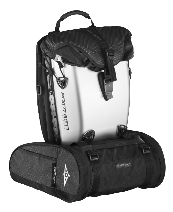
Boblbee 25L with Lumbar Cassette