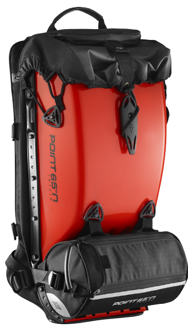
Boblbee 25L with X-Case