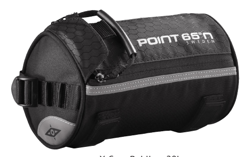
X-Case Boblbee 20L