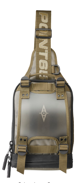
Color: Army Green